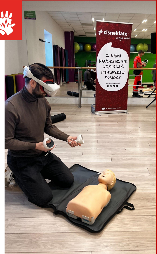
FIRST AID TRAINING AND WORKSHOPS